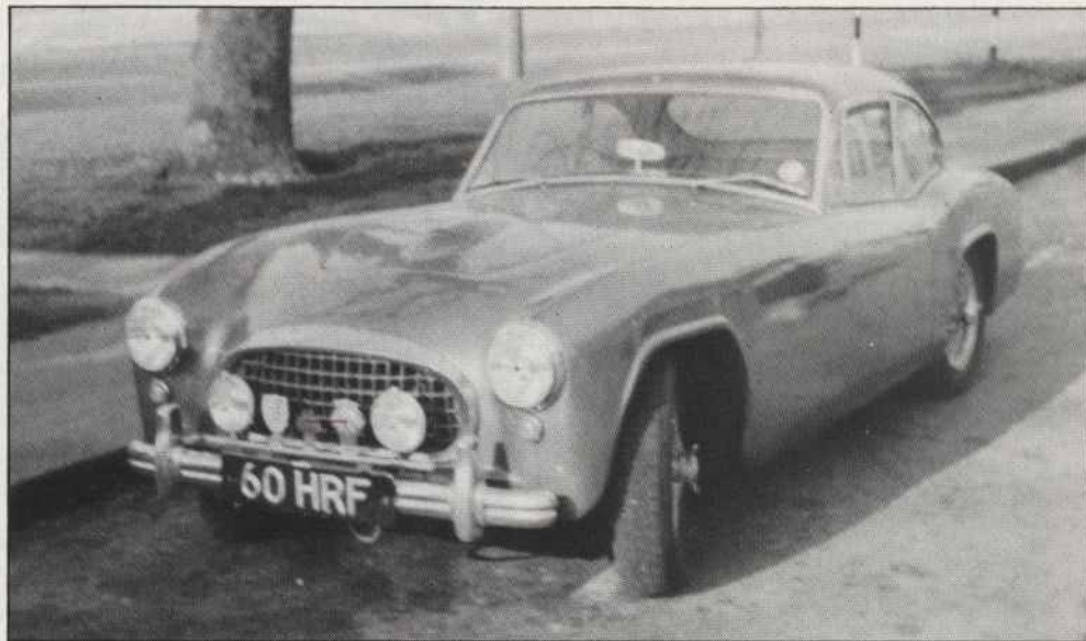
Above: One of the two Mk II Swallow Sabres built; one is now under restoration in Canada, the other in Wales. Below: Actress Mitzi Gaynor with a Doretti; it sold very well in the States and was originally aimed at the West Coast market

Thus the Doretti was killed off not because it was